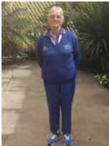
2022-23 WOMEN'S CHAMPION