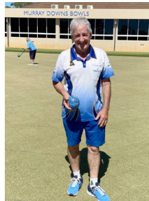
2022-23 MEN'S CHAMPION