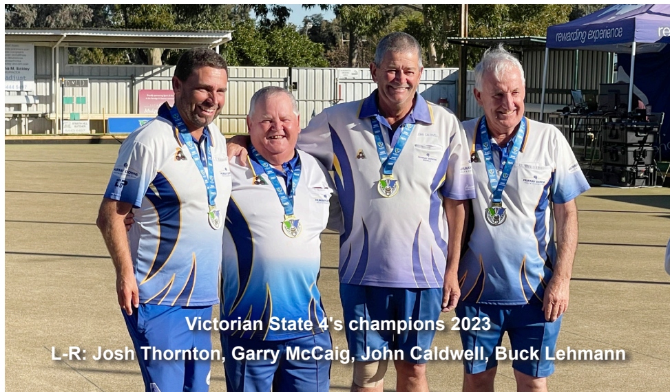
Victorian State 4's champions 2023

Open 7 days a week. Member's DRAW Friday night. Food, entertainment and much more.